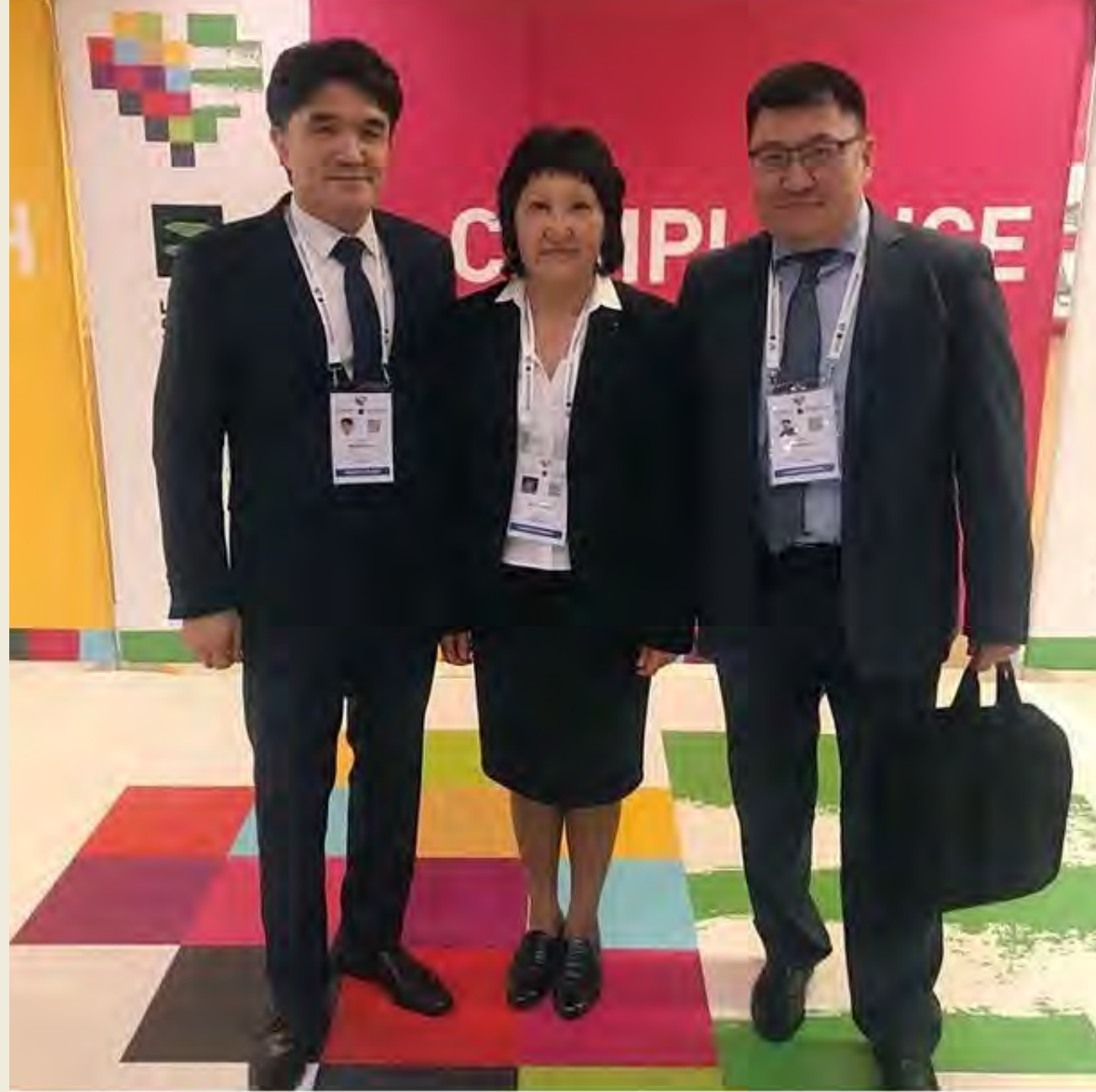
Participation of the Kazakhstani working group at the 5th World Anti-Doping Conference in Katowice, Poland