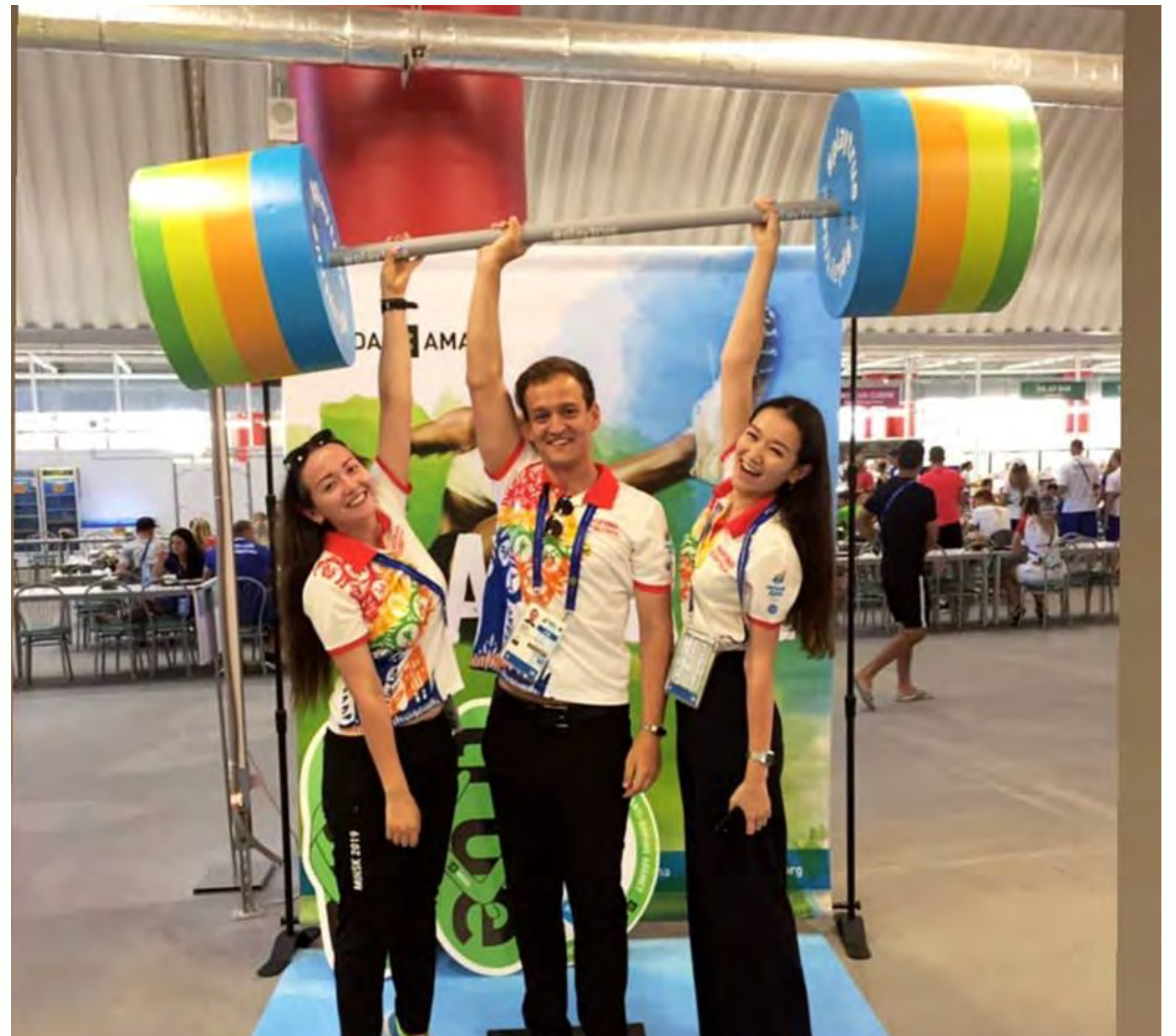
8 specialists from KazNADC took part in organizing the work of the doping control service at the European Games 2019 July, Minsk, Belarus